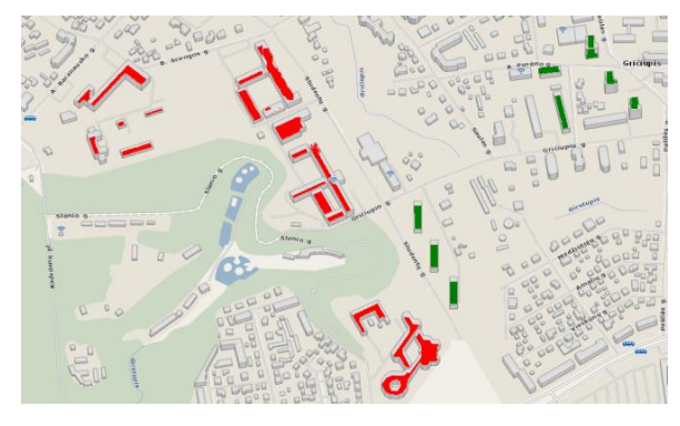
Fig. 2. Territory of the " upper"campus

The "upper" territory is in a residential area of the town. There are 7 faculties and 11 dormitories. 3 of the latter are in the campus territory, while the others are not far from the campus and 3 of them are among the "lower" and the "upper" territories. Students staying in dormitories of the "upper" campus can reach their faculties on foot within 30 minutes.