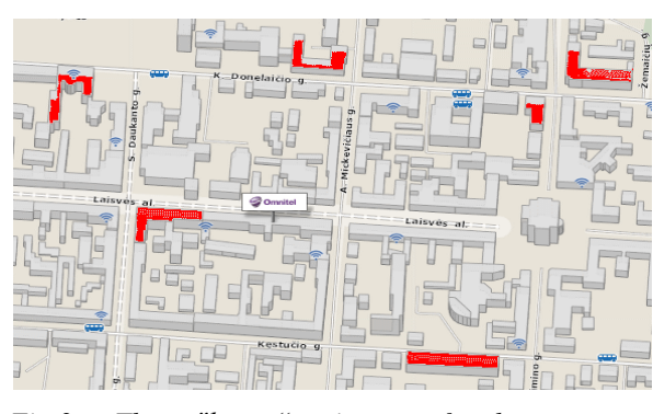
Fig.3. The "lower"territory of the campus

Buildings of the "lower" territory are scattered in the city center (Figure 3). The distance between them is shorter than 1 kilometer. It is convenient to walk in the city center.