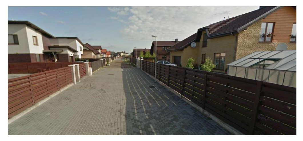
Fig. 12. Streets framed by wooden fences