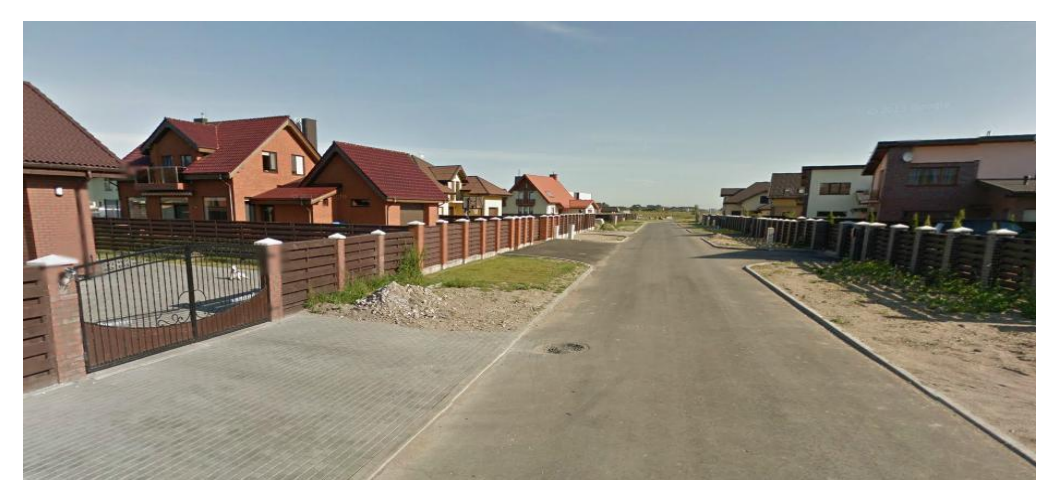
Fig. 11. Streets framed by wooden fences