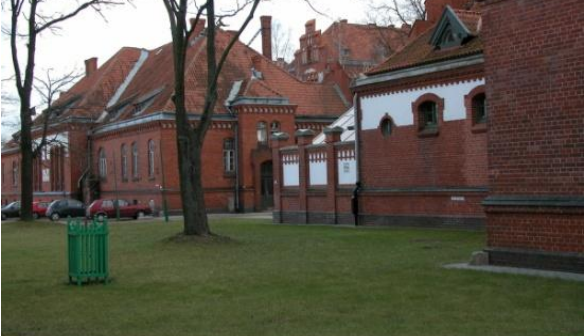
Fig 1-2. Old architecture buildings typical of Klaipėda region

Within a short period of liquidation of the Soviet agricultural system familiar to farmers, after restoration of proprietorship, many things were suddenly changing in Lithuania, and villages were hit by the turmoil which responded to both people and rural architectural heritage. During the period of uncertainty and demolition, there suffered a great number of old buildings (such as, during the Soviet regime abandoned estate mansions or palaces turned into farms). Hasty privatisation, the pursuit of quick profit also devastated rural architectural heritage (for example, the old buildings were acquired only for demolition – making profit from their building materials) (M. Purvinas.).