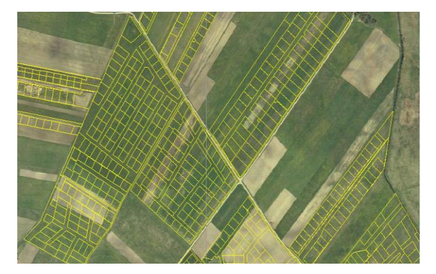
Fig. 6. Newly planned residential area distribution