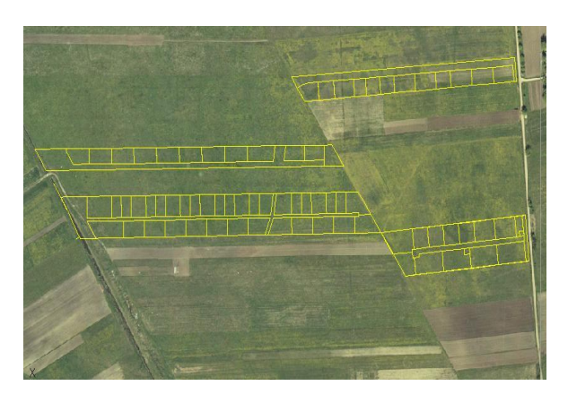
Fig. 8. Newly planned residential area distribution