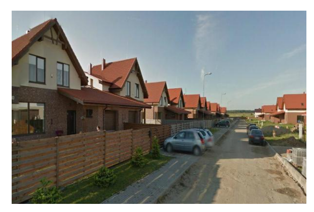
Fig. 10. Residential architectural monotony.

wooden fences without leaving any chances for setting up a green zone. Therefore, green recreation areas (green zones, water bodies or wooded parks) are required among these quarters. Big cities suffer from destruction of public spaces and greenery. For this reason, the ways of solving this problem have to be foreseen for a newly emerging environment, while the natural landscape is to be left intact or minimally touched because it provides recreation to the residents of that area.