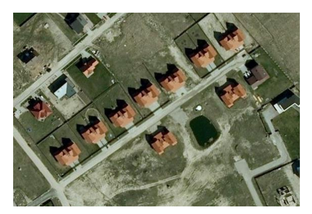
Fig. 9. Residential architectural monotony

Stark contrast is visible in Figure 11. The residents of the street barred themselves in by fences up to driveways without any possibilities for future development, such as for high quality lighting, or for walkways. In this street the fence colour mismatch is seen which creates variegation and does not provide an architectural aesthetic view. Inferior construction fences and building materials downgrade aesthetical buildings standing nearby.