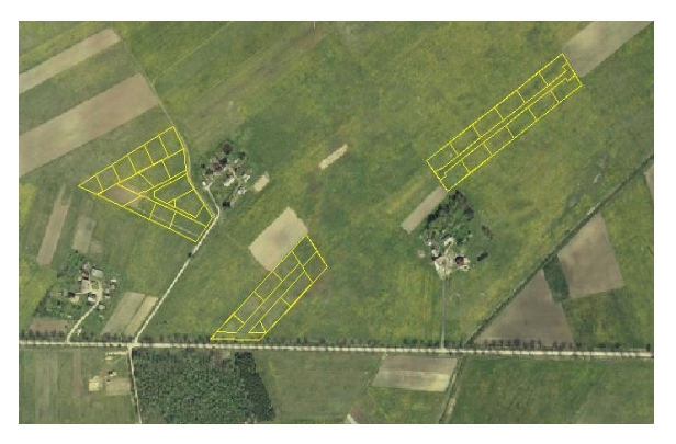
Fig. 5. Newly planned residential area distribution

roadway, besides, a similar fence colour is in each side of the street.