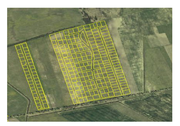
Fig. 7. Newly planned residential area distribution