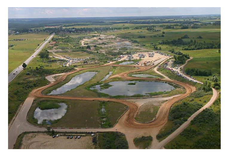
Fig. 4. Application of a quarry to social entertainment needs (Ukmergės...2010)