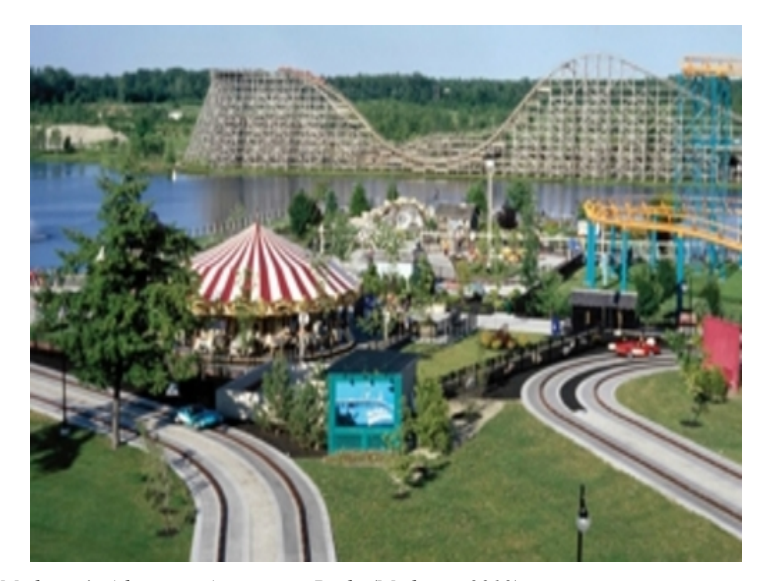
Fig.5. Michigan's Adventure Amusement Park. (Michigan 2010)

Global development of theme parks testifies to the commercial success of their idea. These parks are assigned to the 'attractive places for visitors', where visitors, especially tourists, are not only welcomed, but they are the main focus of the park. It is very important that the theme park idea would be clearly and visually presented to visitors of these parks (Figs 5 - 6). Success of theme park activities is determined by the number of visitors and received profits. Entertainments there are more important than education.