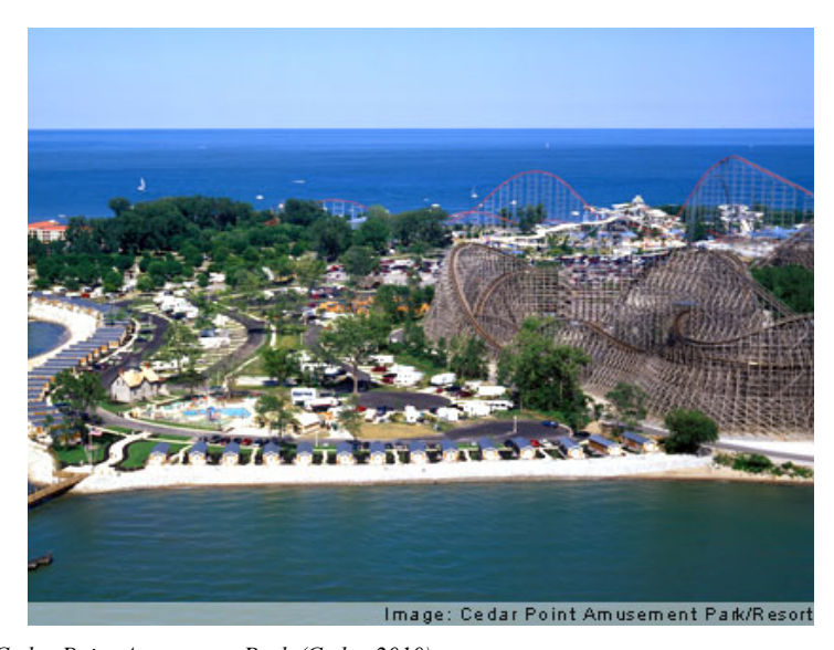
Fig. 6. Cedar Point Amusement Park (Cedar 2010)

The success and demand for theme parks show that one theme is insufficient to people, they need a multi-theme entertainment park equipped with the latest technology, which would justify all the expectations of all the five sensory senses, regardless of the seasons (Bigne et al.2005).