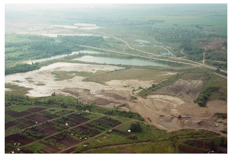
Fig. 3. Application of a quarry to entertainment sport (Re-cultivated... 2010)

experience value and means will be created to clients. It is a determinant factor which exerts an influence on its success in entertainment business.