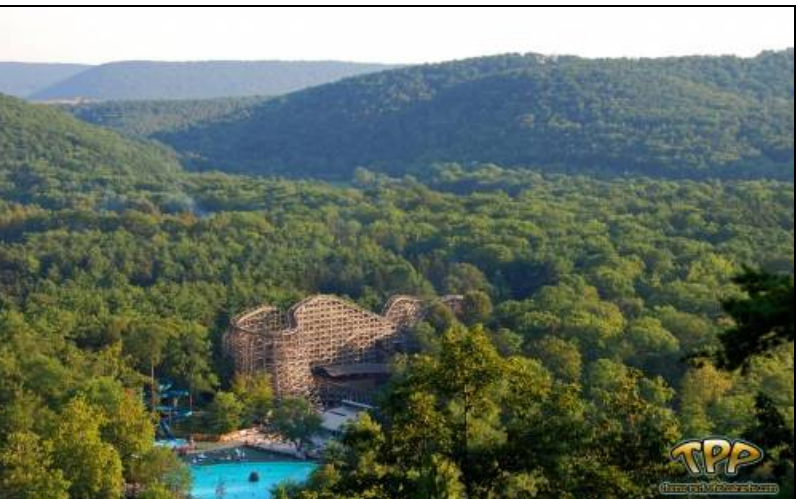
Fig.7. Interface between entertaining landscape plan and natural environment (Thematic... 2010)