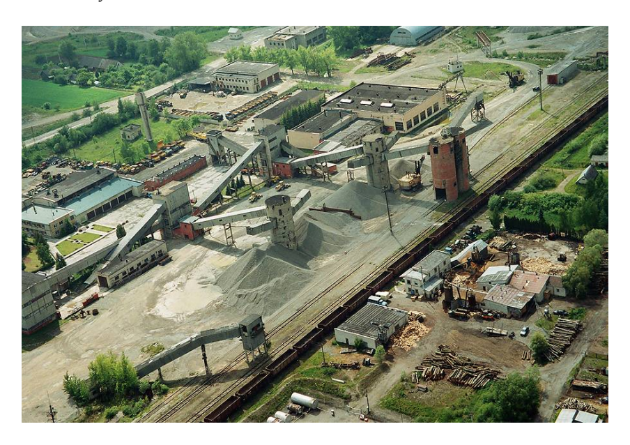
Fig. 1. The bird's eye view of Dolomitas Ltd. factory (Dolomitas AB 2010)

In the process of extraction of non- ore materials resources, the nature of the landscape is being changed three times, while: 1) preparing the land for use; 2) extracting natural resources; 3) recultivating the area. Landscape changes are deep, superficial, local, regional and even global. Extraction of natural resources takes place in a large area, whereas their processing occupies even in a larger area than other types of industries.