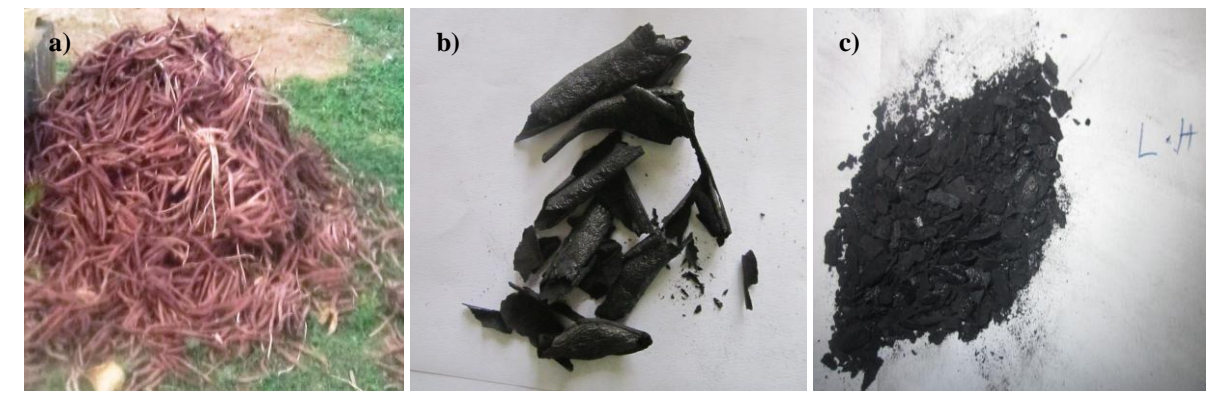
Figure 1. Different structures of locust beans husk: a) pile of locust beans husk; b) carbonised locust beans husk; c) granulated locust beans husk char.

wood ash (Chojnacka & Michalak, 2009) are examples of such materials. Other adsorption assessment tools are isotherm and adsorption kinetic. These evaluation tools examine adsorbent effectiveness in relation to the selected sorbate. Hence, the study investigates carbonised post-harvest waste (locust beans husk char) usability as biosorbent in some heavy metal removal from mildly polluted surface water.