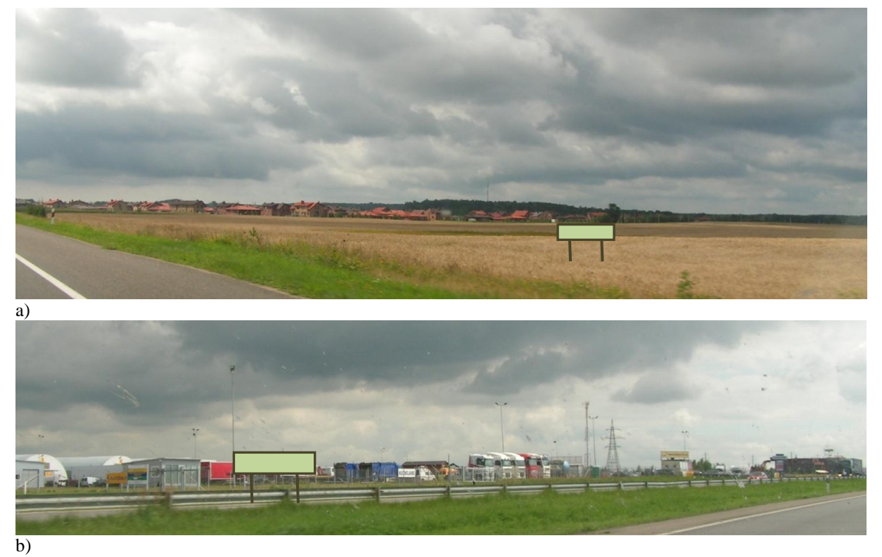
Fig. 6. Examples of FSB layout and visual contrast level in agrarian urbanized (a) and urban (b) landscape of a suburban zone: FSB does not cross horizon line and is perceived as an accent in the visual space of the agrarian urbanized landscape (a); FSB crosses a horizon line and dominates in the visual space of the urban landscape (b)

composition (character and layout of visual dominants, accents and background elements and their physical and visual features).