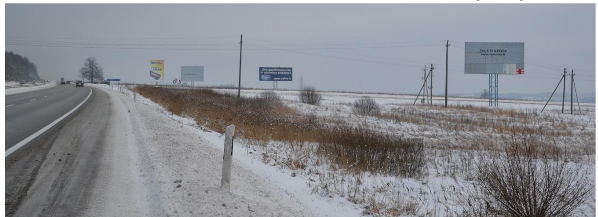
Fig. 2. FSBs of different sizes and shapes close to road A1 between Vilnius and Kaunas

Rectangular FSBs dominate near the roads whose length is bigger than their height. FSBs, the height of which is bigger than the length, are noticed less frequently. They usually cut a horizon line and generate higher visual pollution than the others. Visual pollution is more intensive when the shape of FSB differs in the same visual space (Figure 2).