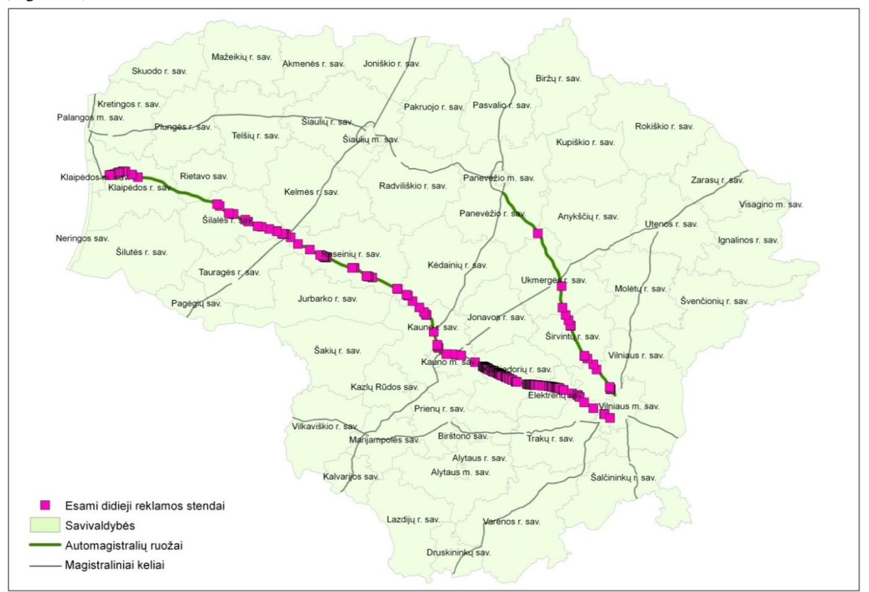
Fig. 1. Locations of FSB close to the main highways of Lithuania: A1 Vilnius-Kaunas-Klaipėda and A2 Vilnius-Panevėžys

analysed highways. Several FSBs are located at the other Lithuanian state roads too. The highest FSBs density is close to road A1 between Vilnius and Kaunas (length ~ 100 km). There are 116 FSBs. The second road sector according to FSBs density is between Kaunas and Klaipėda (length ~ 200 km). There are 66 FSBs. The third sector is between Vilnius and Panevėžys (length ~ 130 km) in which only 16 FSBs are located.