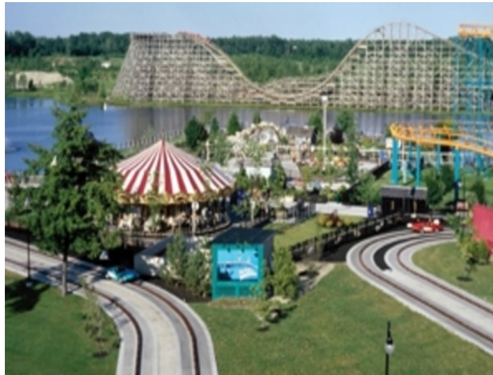
Fig.5. Michigan's Adventure Amusement Park. (Michigan 2010)

Global development of theme parks testifies to the commercial success of their idea. These parks are assigned to the 'attractive places for visitors', where visitors, especially tourists, are not only welcomed, but they are the main focus of the park. It is very important that the theme park idea would be clearly and visually presented to visitors of these parks (Figs 5 - 6). Success of theme park activities is determined by the number of visitors and received profits. Entertainments there are more important than education.