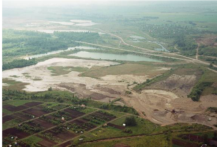
Fig. 3. Application of a quarry to entertainment sport ( Re-cultivated... 2010 )

experience value and means will be created to clients. It is a determinant factor which exerts an influence on its success in entertainment business.