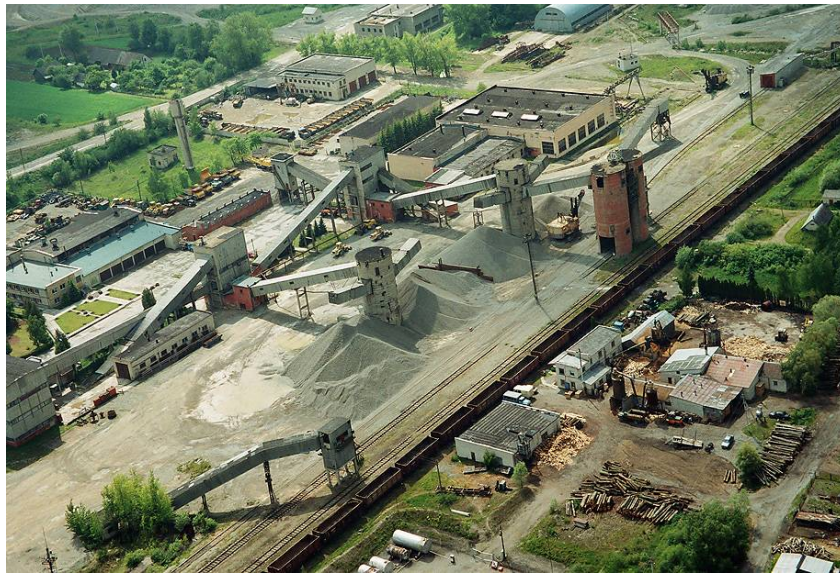
Fig. 1. The bird's eye view of Dolomitas Ltd. factory (Dolomitas AB 2010)

In the process of extraction of non-ore materials resources, the nature of the landscape is being changed three times, while: 1) preparing the land for use; 2) extracting natural resources; 3) re-cultivating the area. Landscape changes are deep, superficial, local, regional and even global. Extraction of natural resources takes place in a large area, whereas their processing occupies even in a larger area than other types of industries.