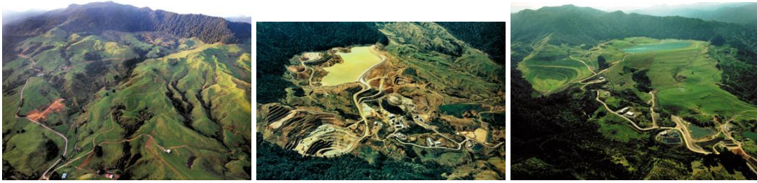
Fig. 2. Changes in the landscape of natural resources in re-cultivation. Quarry view in 1990-1994-2001 (Re-cultivated ... 2010)