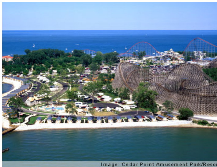
Fig.6. Cedar Point Amusement Park (Cedar 2010)

The success and demand for theme parks show that one theme is insufficient to people, they need a multi-theme entertainment park equipped with the latest technology, which would justify all the expectations of all the five sensory senses, regardless of the seasons (Bigne et al.2005).