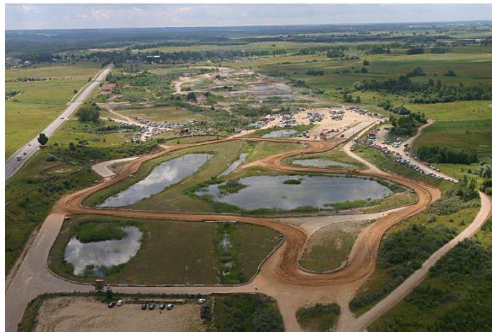
Fig. 4. Application of a quarry to social entertainment needs ( Ukmergės...2010 )