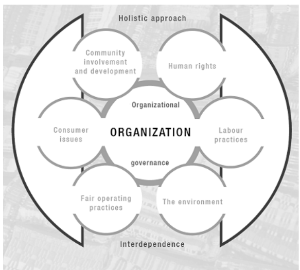
Fig. 1. The 7 core subjects of social responsibility in ISO 26000 (ISO 2010a; ISO 2010b)

ISO 26000 addresses seven core subjects of social responsibility, namely (1) organizational governance, (2) human rights, (3) labour practices, (4) the environment, (5) fair operating practices, (6) consumer issues and (7) community involvement and development (ISO 2010a; ISO 2010b) (see Fig. 1).